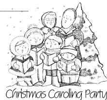
Christmas Caroling Party