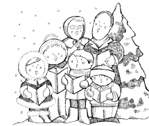
Christmas Caroling Party